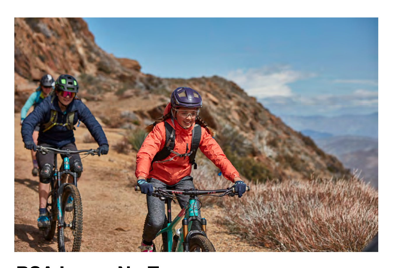
BSA Leave No Trace Level 1 Instructor Course Manual