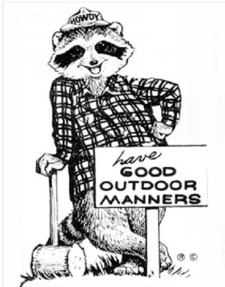
Pennsylvania Forest Service 1959